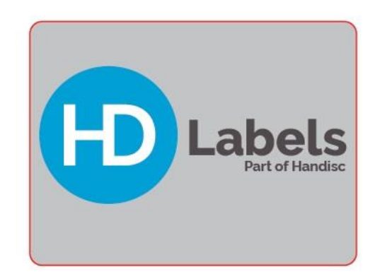
Example artwork with bleed & cut line